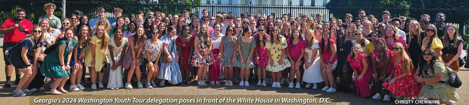
Georgia's 2024 Washington Youth Tour delegation poses in front of the White House in Washington, D.C.